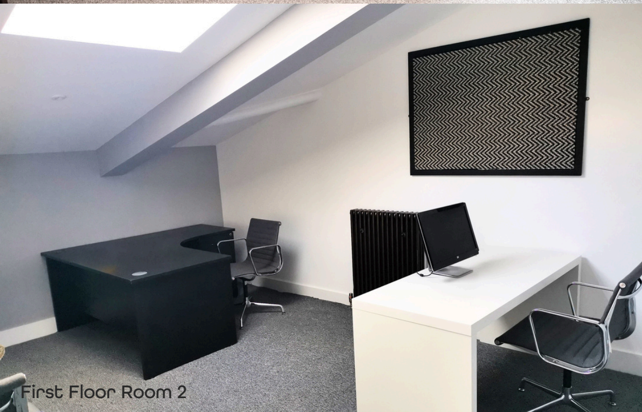
First Floor Room 2

JUST MOMENTS FROM CHESTER'S FINEST DINING, SHOPPING, AND TRANSPORT LINKS