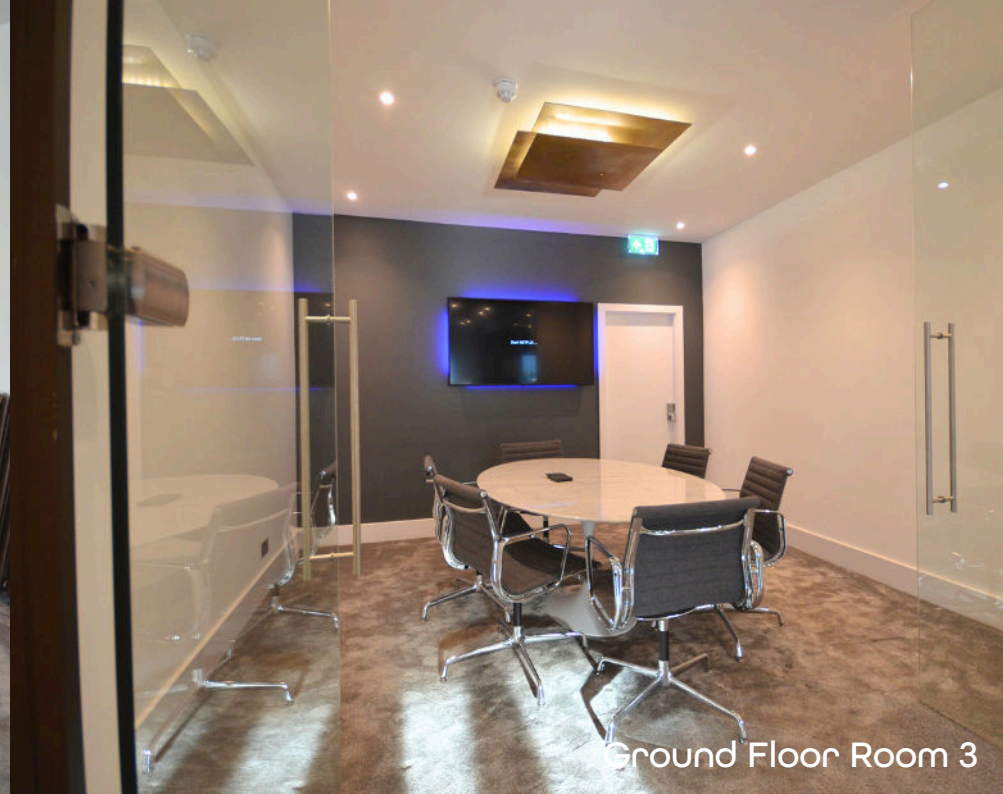
Ground Floor Room 3