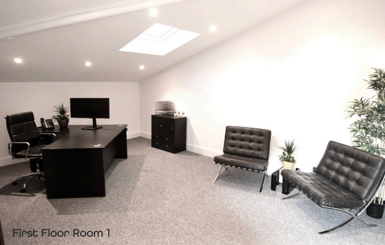
First Floor Room 1