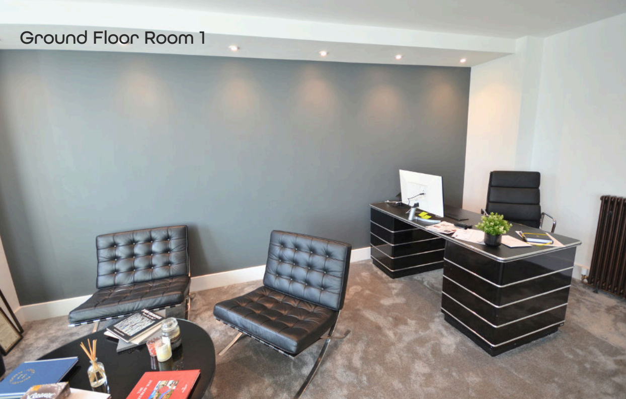
Ground Floor Room 1