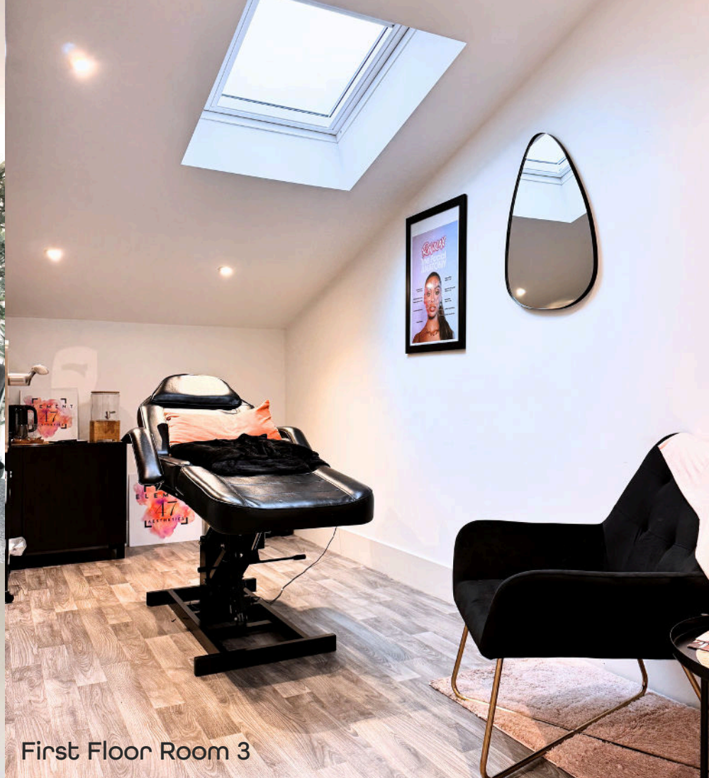
First Floor Room 3