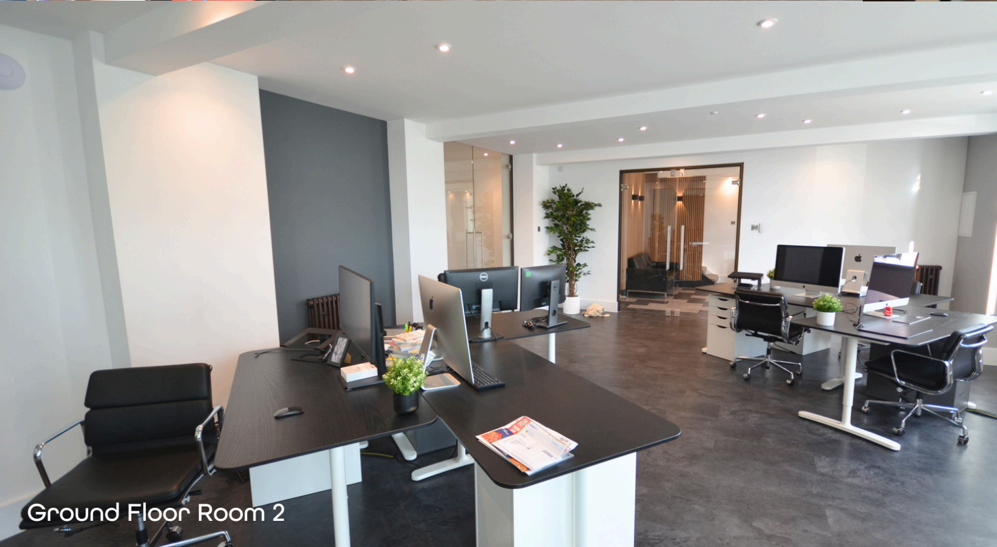
Ground Floor Room 2